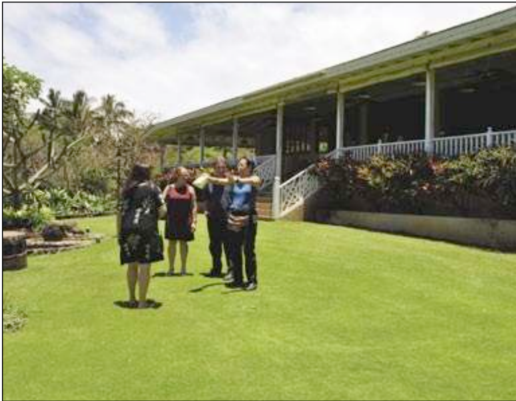
A few of the participating vendors discuss about the ceremony which will take place at Plantation Gardens Restaurant.